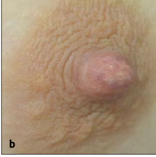
Figure 3. a, b. Case 3 treated with Onesti technique