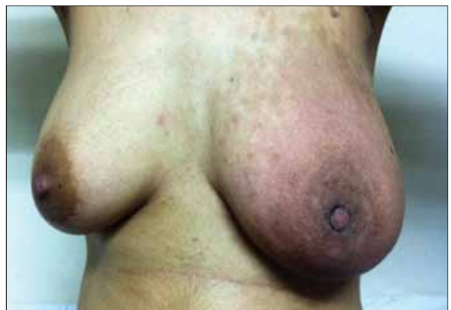
Figure 3. Image of the left breast which is larger than the right and presents with slight erythema

Lymphomas of the breast present similar symptoms as the ones in breast cancer. Brustein et al. (6) reported that 93% of their 53 patients presented with a painless mass in the breast at admission. In a similar vein, Ganjoo et al. (5) reported a rate of 65% for the painless mass and