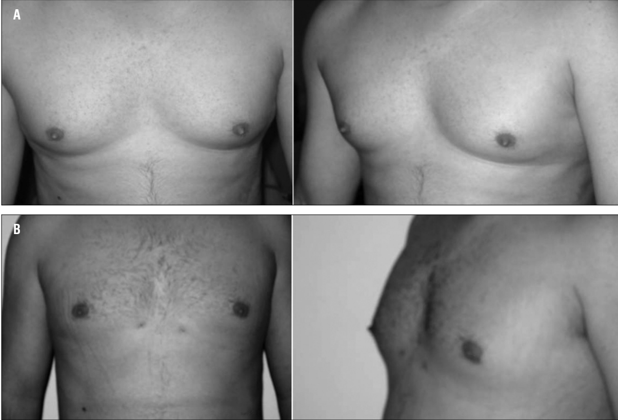
Figure 3. A. Preoperative view of a 21-year-old patient treated with conventional liposuction for bilateral gynecomastia B. postoperative view.

to avoid extra-areolar scar; keeping it on superior (12,13) or central (14) pedicle. The surgeon faced with a wide range of excisional procedures, but no single technique is suitable for all forms of gynecomastia.