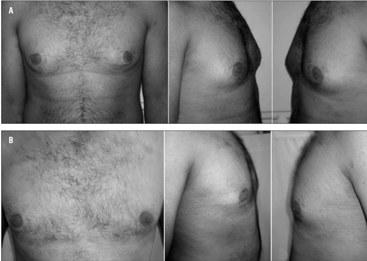
Figure 4. A. Preoperative view of a 23-year-old patient treated with conventional liposuction for bilateral gynecomastia B. postoperative view.

redundancy. Majority of our patients were classified as moderate enlargement with skin redundancy. We thought that marked enlargement with marked skin redundancy was not suitable for conventional liposuction. Open techniques or combination methods are more useful for marked enlargement with marked skin redundancy.