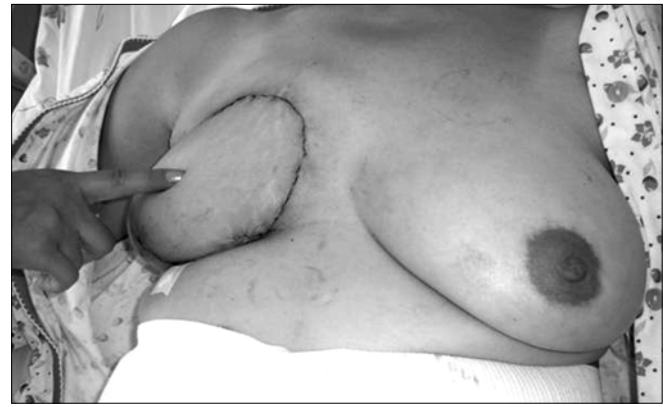
Picture 2. Evaluation of capillary refill

flap should also be evaluated for oversensitivity or edema at this time. The expected outcome here is for the flap to be warm, not cool (19). Warmth helps dilate veins and increases circulation. For this reason the patient's room should be kept at a temperature of between 24°C and 31°C with the door closed, and the patient should be covered with warm, air-circulating blankets during transport from the recovery unit to the clinic (13,19). With recent technological developments, it is now possible to assess the temperature of the flap with monitors that measure skin temperature with a probe (Picture 1). Another point that requires care while measuring the temperature of the flap is to compare the flap's temperature with the patient's body temperature. There should be an average difference of 2°C-3°C between the body temperature and the flap's. Where the flap is cooler, development of arterial insufficiency should be considered. A lower flap temperature must be reported to the surgeon immediately (20).