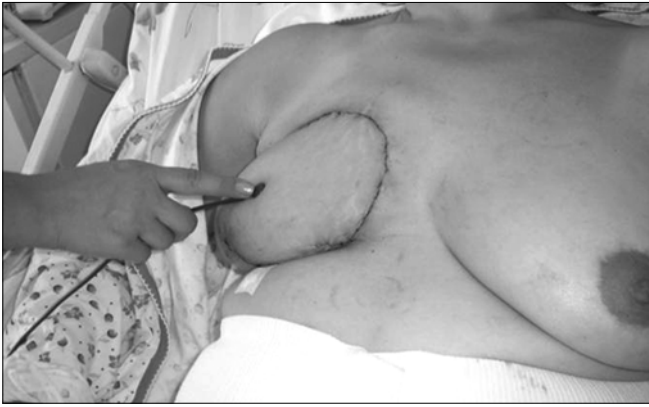
Picture 1. Evaluation of flap temperature