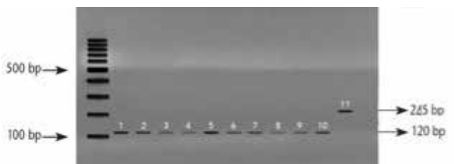
Figure 2 Gel showing the internal control (GAPDH, 120 bp) and positive control ( E. coli ATCC 25922, 245 bp).