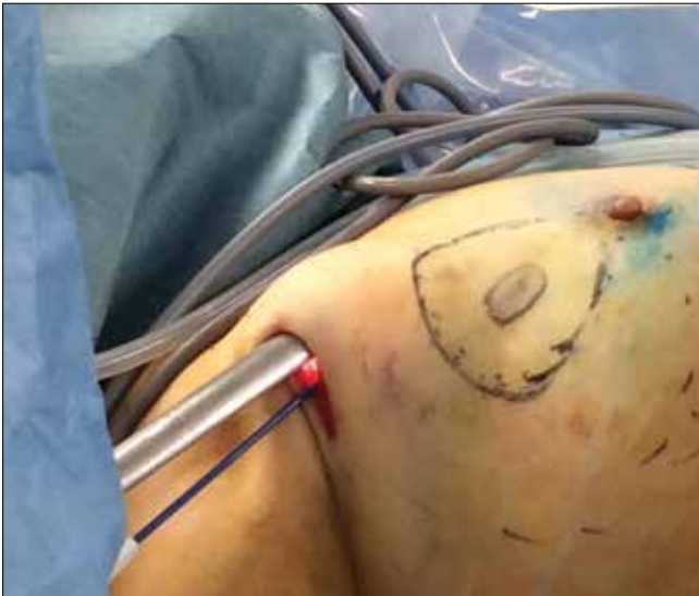
Figure 3. The dissection performed using special lighted breast retractor in deep sites while the skin flap is prepared in the posterior site is observed. Wound protective material is also used for areola dissection