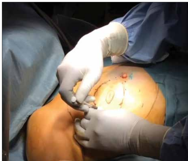
Figure 2. Subcutaneous stain injections at several points on the excision margins are seen

Axillary and periareolar incisions are the most frequently used incisions in both mastectomy and breast-conserving surgery. The incision used in axilla is a generally an incision that is 2 cm, which is made for sentinel lymph node, and it is used for dissection performed in the posterior part of the breast (1-4, 6-9, 11, 16, 17, 20). To create a skin flap, a periareolar incision is used. In addition to this incision, an additional skin excision in the shape of half moon is used to enlarge the incision, thereby facilitating the removal of excised tissue through here. The site for periareolar incision is determined on the basis of