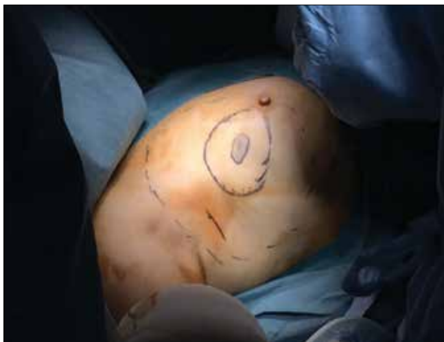
Figure 1. Marking and drawing on the breast. The tumor margins (innermost), excision margins (middle ring), margins of dissection and mobilization to be performed in the anterior and posterior sites (outermost) and the lymph node incision in the axilla are shown

for distant metastasis are accepted as exclusion criteria in many clinics. No consensus are present for patients that would receive preoperative or post-operative radiotherapy. The results indicate that this technique can be performed in such patients (13-15).