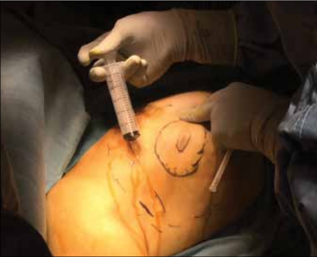
Figure 7. The periareolar incision line is drawn before anterior site dissection is started. The incision entrance will have been slightly enlarged with a skin incision in a half moon shape