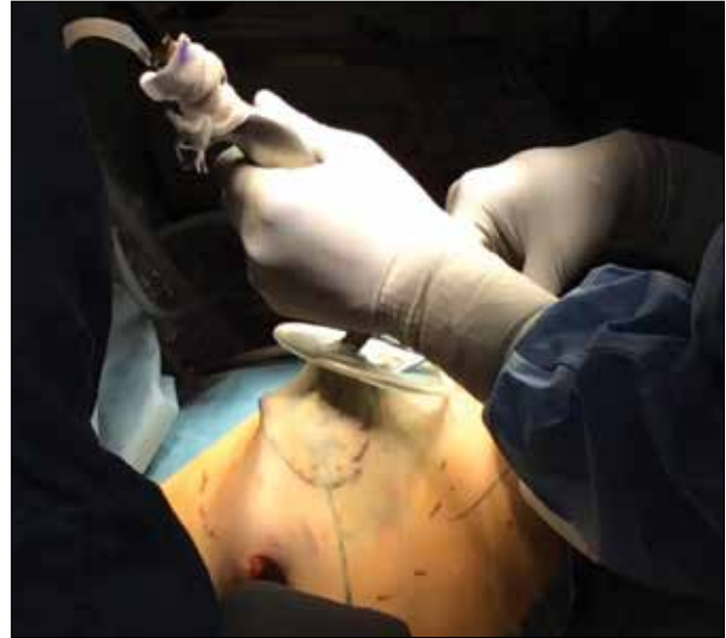
Figure 9. Working through the periareolar incision, the skin traction is ensured, advancement in the subcutaneous plane is made and the breast tissue is separated from the skin

Volume Replacement: If the excised tissue is 30% of the total breast or more or the cavity that emerged cannot be closed with volume displacement, the latissimus dorsi flap or lateral thoracic adipose tissue flap mobilized with endoscopic technique can be brought to the cavity by working through the axillary incision (1, 9).