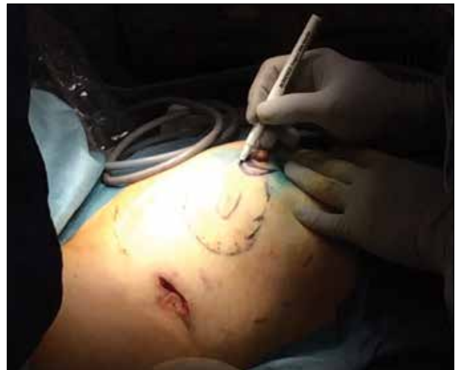
Figure 6. Dissection using a pair of bipolar scissors under endoscopic guidance in the posterior site is seen in the monitor. The breast tissue is mobilized in the space between the breast tissue and pectoral muscle and at the edge of the pectoral muscle in the outer lateral side

cutaneous plane in a radial way towards the periphery from the nipple (7). Then, the septa between tunnels are cut. One of the different methods employed as part of the tunnel method is the creation of tunnels using bladeless trocars (Optiview, Bladeless Trocar, Endopath, Visiport Plus) (1, 3-6, 8, 11, 13, 16, 17, 20).