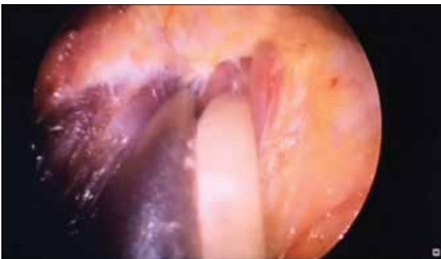
Figure 4. Endoscope (retractor) is inserted through the axillary incision and the posterior site is dissected with electro-cautery as seen. Here, endoscope is also used as a retractor