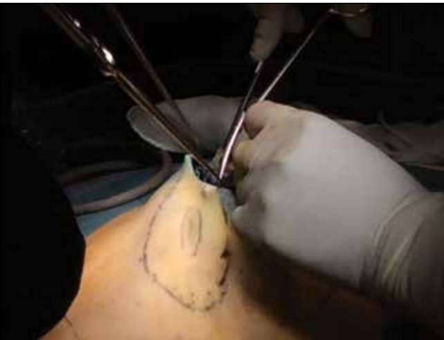
Figure 8. Before starting dissection in the anterior site, injections of physiological saline solution with Epinephrine at a ratio of 1/1.000.000 are performed in the previously marked mobilization area. This procedure would ensure a dissection that is not only easy, but also causes relatively less bleeding

tion can be employed here, as well. The most commonly used techniques include the volume displacement, volume replacement and filling techniques.