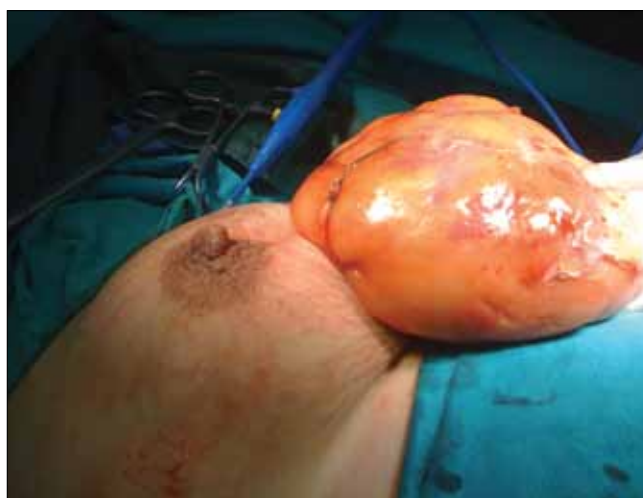
Figure 2. Image of intraoperative hamartoma