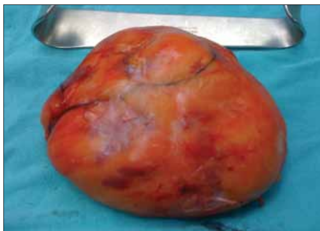
Figure 3. Breast hamartoma immediately following removal